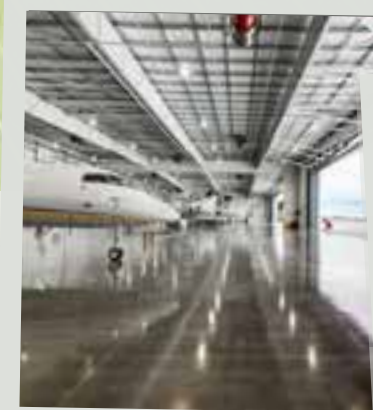
AIR, RAIL, SEA